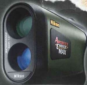
Nikon Archer's Choice Max Rangefinder